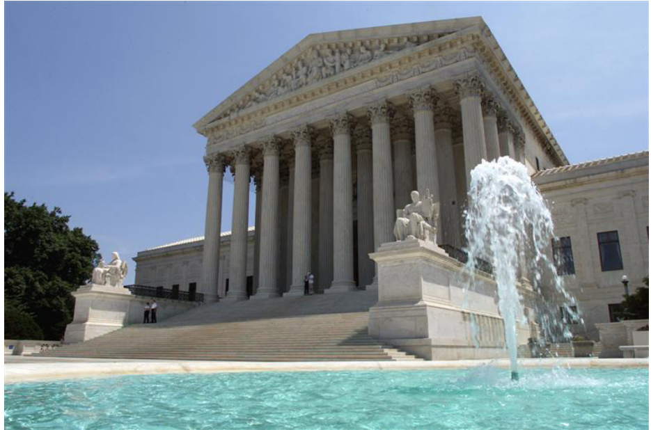
U.S. Supreme Court building

“The financial and other benefits that the parties derive from employment arbitration are likely to disappear altogether if they are forced to submit to complex, class-based arbitration even where the underlying agreement does not provide for class arbitration procedures,” the Equal Employment Advisory Council, a group of about 300 large employers, wrote in its brief.