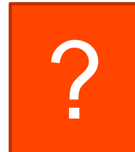
Unknown Democrat Term would expire 6/30/27